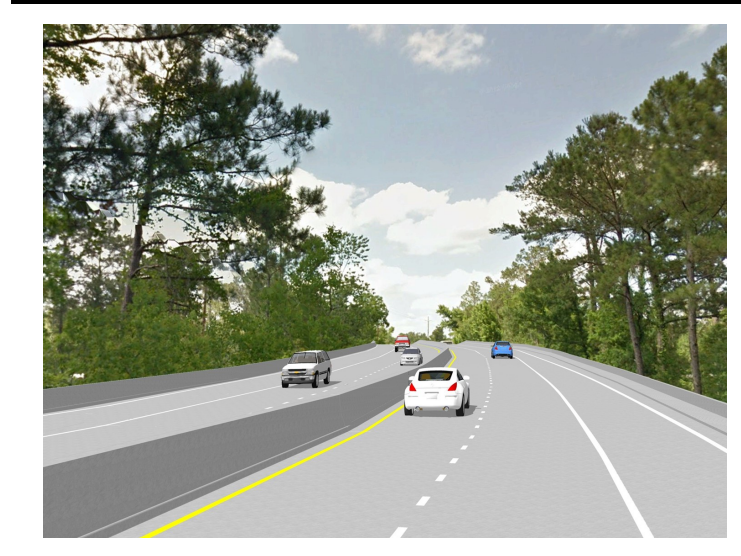
Visualization the Bridge Preferred Alternative. The view is looking north on US 11.